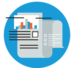
PQRS QCDR REPORTING