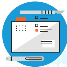
SURGICAL CASE MANAGEMENT